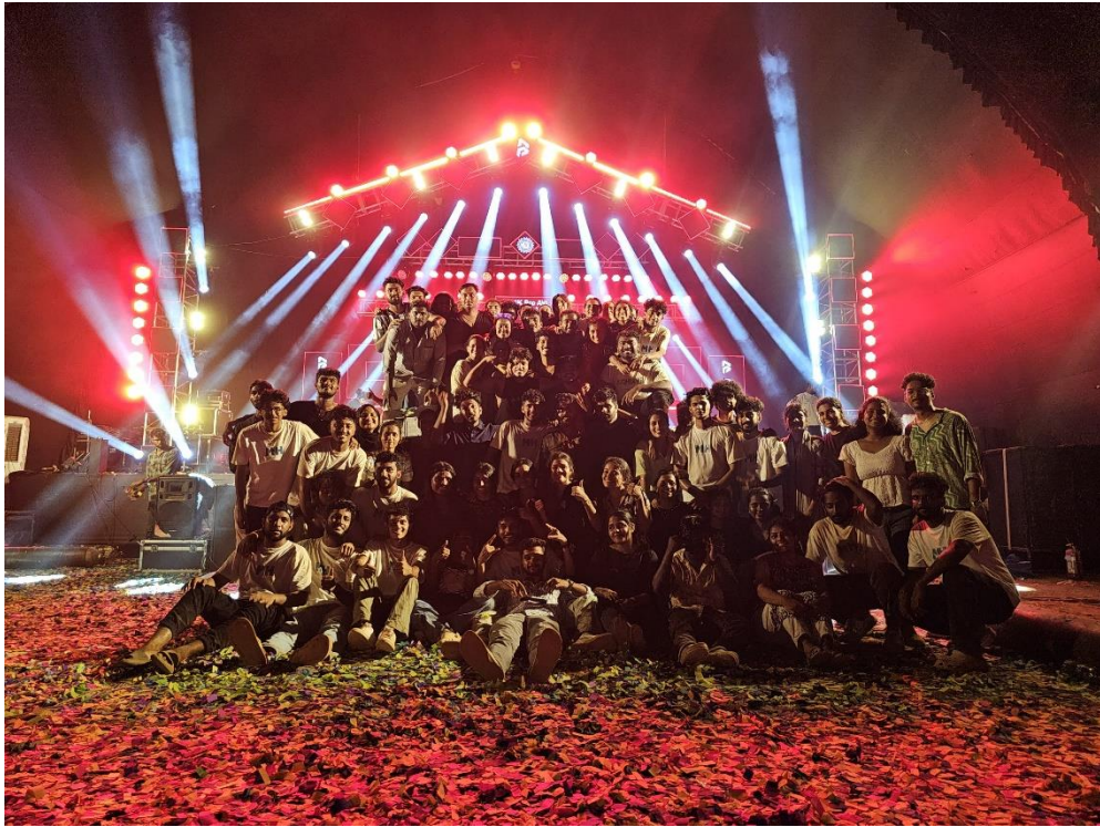
Convener, Regalia 2024